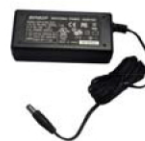
Led power supply