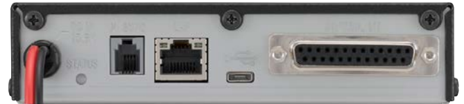
Micro USB and DSUB25 Interface for future functions.

KTI-5 is provided as only HARDWARE and becomes Type-D Network Adapter functional product when SOFTWARE (KPG-1006DNA) is installed (loaded). This concept is like PC and Software.