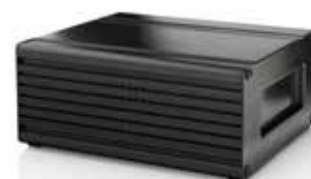
Radio Transceiver + Alfatronix Desktop Power Supply + Alfatronix Battery Back Up Box